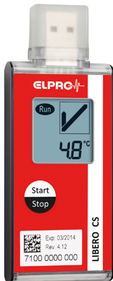
Multi-Level PDF Logger

With LIBERO C and liberoMANAGER, ELPRO offers the most complete and cost-effective Cold Chain Monitoring Solution ever. From production to distribution to the final site, the LIBERO C portfolio and liberoMANAGER are applicable for any step in the cold chain. The LIBERO C portfolio now includes a Multi-Level PDF Indicator. No software to send, no software to receive, no software for reporting and no software for data warehousing – we call it the most complete no-software solution. Designed for pharmaceutical companies with complex distribution chains for commercial products and clinical trials. All components are fully qualified according to GAMP5 and compliant to CFR 21 part 11.