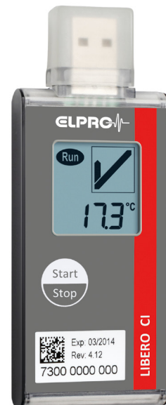
Multi-Level PDF Indicator