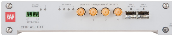
External ASI module for Phoenix G2 IDU, 4x BNC, 2x SFP ports

Phoenix G2 split mount system is designed to fit in a classic telecom architecture with a radio located outdoors and a sheltered indoor unit. Supporting channel bandwidths of up to 60 MHz, the Phoenix G2 offers capacities of up to 452 Mbps full duplex in 1+0 configurations.